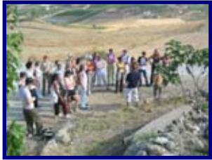
Research, Tourism & Archaeological discoveries in Sicily (ITALY)