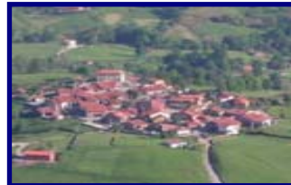
Roman Paved road "Cambera de los Moros", Cantabria (Spain)