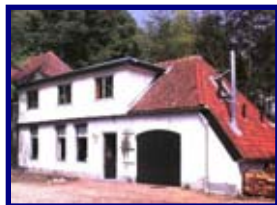
Crossing Boundaries (Netherlands)