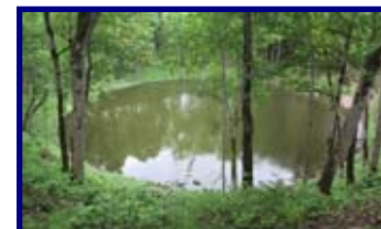
Project Kopu (Estonia)