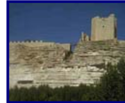
Recovering the cultural heritage in Albacete (SPAIN)