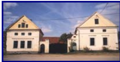
Construction of an educational trail in Cernotin (Chk. Republic)